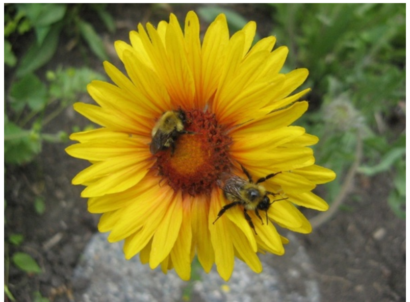
Bombus perplexus bees on Gaillardia aristata .