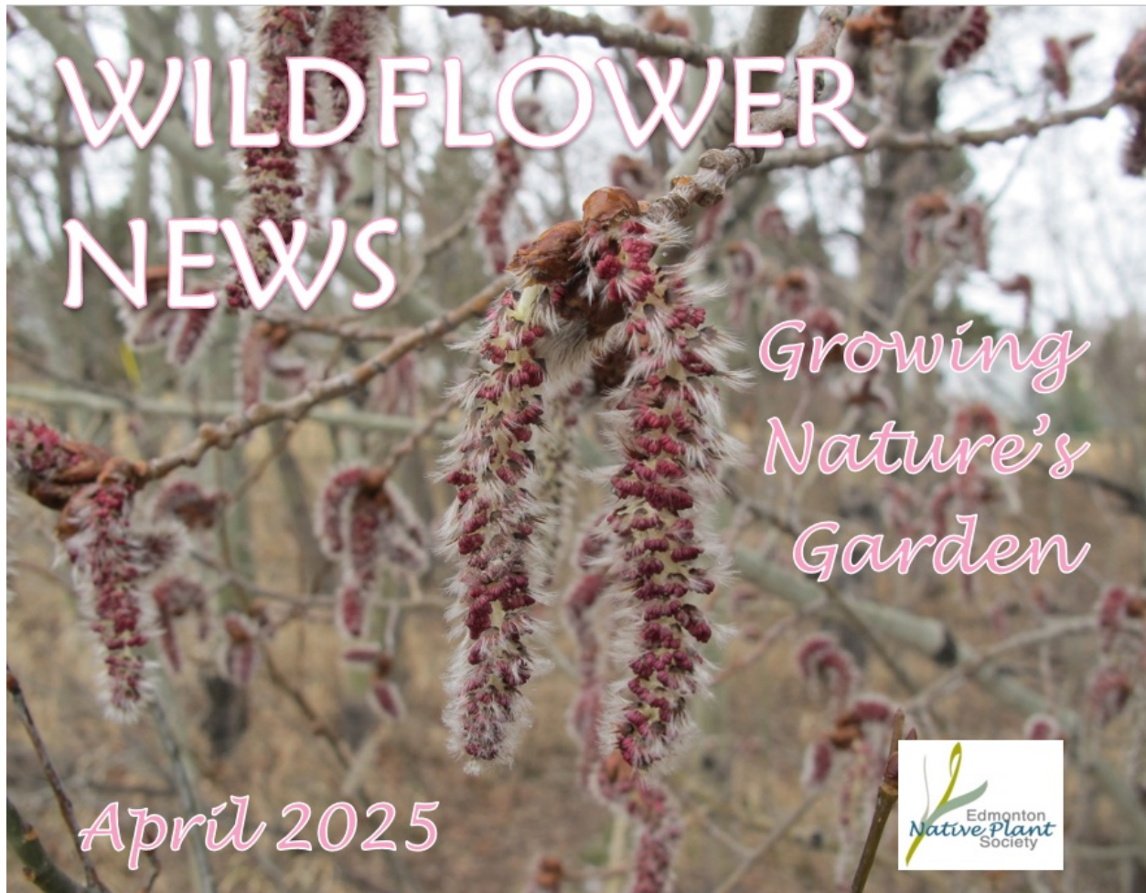
Male catkins of Populus tremuloides (native aspen), Edmonton, 2011-04-28.