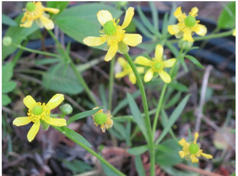
Prairie buttercup ( Ranunculus rhomboideus) in flower at Nisku Prairie, 2011-05-18.